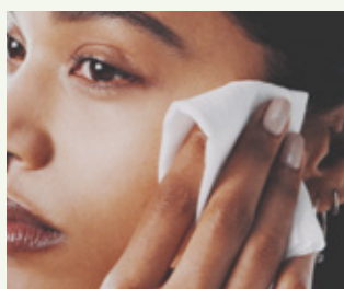
Wet Wipe Solutions