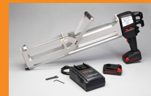
Millennium One Step™ Battery Powered Applicator