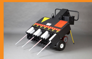
Patented One Step™ Multi-Bead Plus**

H.B. Fuller's One Step™ application equipment ensures trouble-free, quick and easy roofing installations. With the ability to fix adhesive bead spacing, our Patented Multi-Bead Applicators assure proper adhesive application and are the fastest way to install insulation.