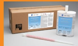
Millennium One Step™ Foamable Adhesive®

Millennium Insulation Adhesives are cold applied, essentially VOC-free two part foaming adhesives that set quickly in all climates. Applied with our patented Multi Bead Plus** Applicator, the One Step™ delivery system is the fastest, most effective way to attach roof deck insulation.