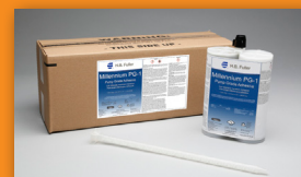
Millennium PG-1 Low Viscosity Insulation Adhesive