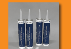
Millennium EPDM Edge Sealant