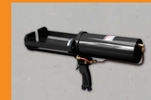
Millennium One Step™ Pneumatic Applicator

**US 9,381,536 B2; US 7,056,556 B2; US D501,855 S; CA 2,493,739 C