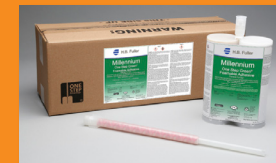
Millennium One Step Green® Insulation Adhesive