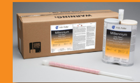
Millennium One Step™ Night Seal®