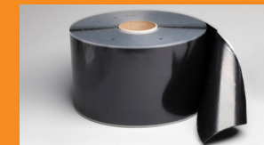
Millennium EPDM Series Flashing and Cover Tape