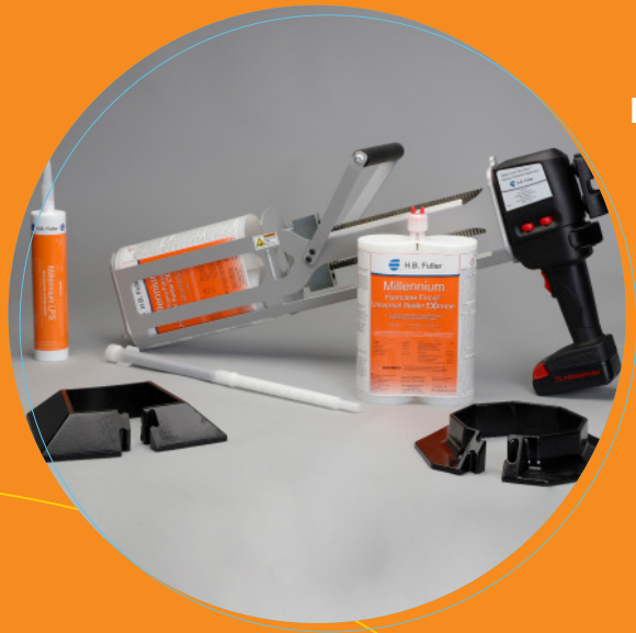
Standard Square Lockin' Pocket® and Accessories

Standard Octagon and Square Lockin' Pocket® Kits contain pre-fabricated inter-locking pockets and two cartridges of Millennium LPS Sealant used to seal around penetrations and to bond the pocket to the surface of the membrane. Millennium Hurricane Force® Universal Sealer Extreme used to fill the pocket is sold separately.